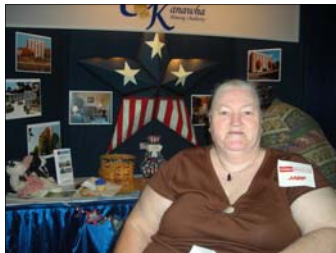
Judith Ellard Jarrett Terrace