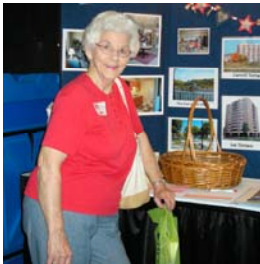
Jean Walton Lippert Terrace