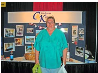
Evelyn Adkins Carroll Terrace