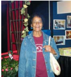
Mary Morgan Jarrett Terrace

Charleston-Kanawha Housing Authority participated in the Senior Expo at the Charleston Civic Center May 15th and 16th. More than 500 people stopped by CKHA's exhibit. Several residents were spotted at the event: